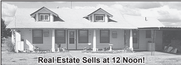
Real Estate Sells at 12 Noon!

SALE & PROPERTY LOCATION: From the Intersection of Hwy. 6 & Hwy. 66 West of Elk City, OK, go 5 miles West on Hwy. 6, North 1 mile and 1/2 mile West.