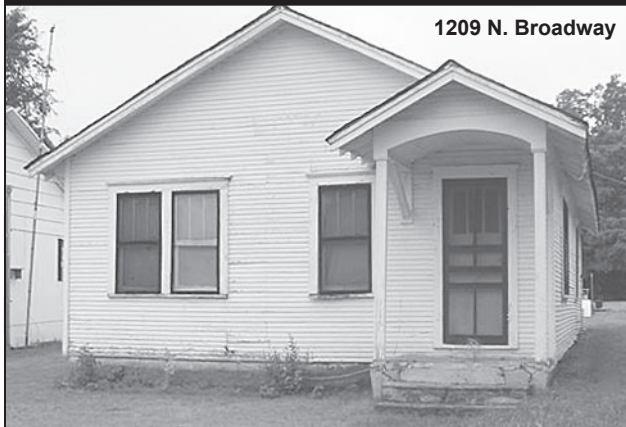
1209 N. Broadway

LEGAL DESCRIPTION: The South 20 feet of Lot 17 and the North 15 feet of Lot 18 in Block 8 of the Kready Addition to the Town of Sayre, Oklahoma. Surface only.