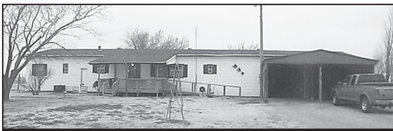
Real Estate Will Sell At 12:00 noon!

Property Location & Sale Site: From I-40, Exit 38, South of Elk City, OK go 2 miles South On Hwy. 6 then 2 miles East and then 1/4 North to sale site.