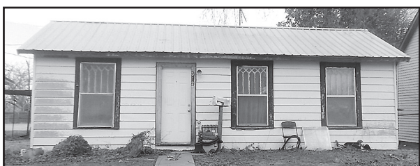
Real Estate Sells at 11:00 a.m.

SALE LOCATION: 1016 E. Airport Industrial Road, Elk City Convention Center, Elk City, OK (Exit 41 go West 1 mile)