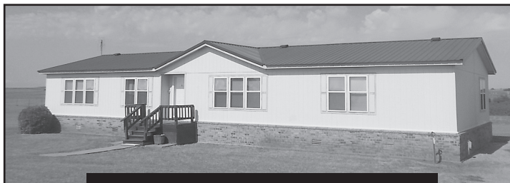
Real Estate Sells at 11 a.m.

PROPERTY & SALE LOCATION: 11307 N. 1900 Rd, Sayre, OK – From the Cemetery Road, Exit 26 off of I-40, East of Sayre, OK, go 2 ½ miles North on BC 1900 Rd to the property location.