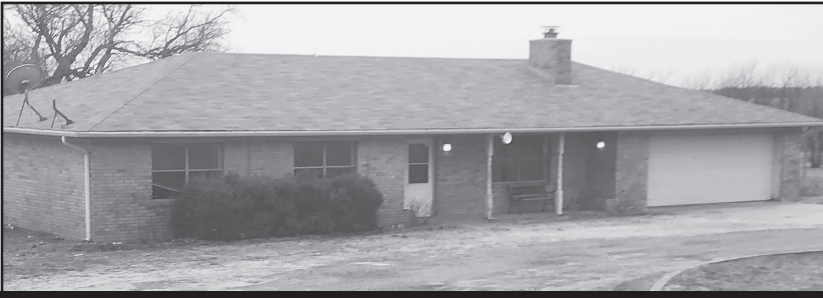
Real Estate Sells at 11:00 am

3 Bedroom, 1 3/4 Bath Home on 5 Acres near Elk City, OK Tractor • Farm Equipment • JD Gator • Mower • Shop Tools Shop Equipment • Household • Furniture • Appliances